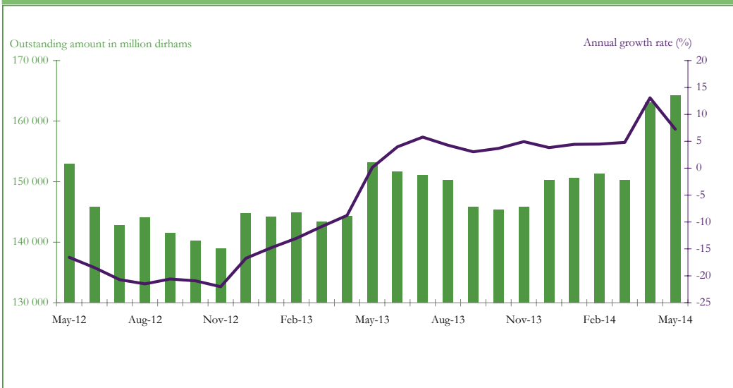
Chart 3: Change in Net international reserves