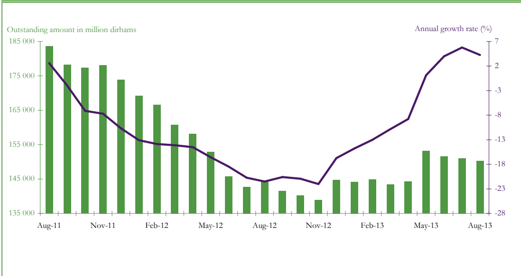
Chart 3: Change in Net international reserves