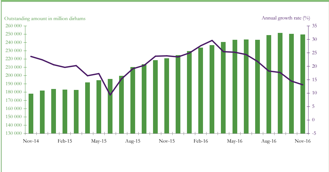
Chart 3: Change in Net international reserves